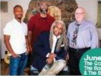
June 19 The Good, The Bad & The Blues

Ottawa Park Amphitheater 6 p.m. – 8 p.m. 2205 Kenwood Blvd. (Behind the Toledo Police Department Sub-Station.)