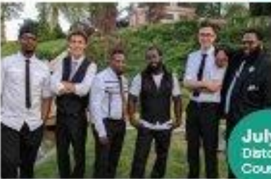
July 17 Distant Cousins