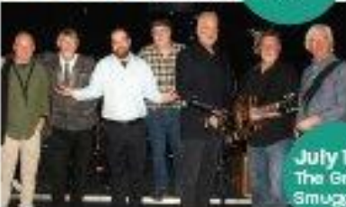
July 10 The Grape Smugglers