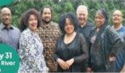
July 31 East River Drive