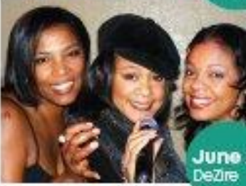
June 26 DeZire