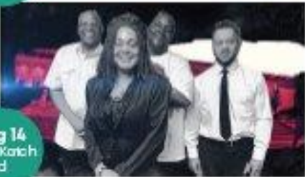
Aug 14 The Katch Band