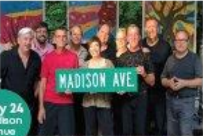
July 24 Madison Avenue