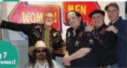
Aug 7 Loco weed